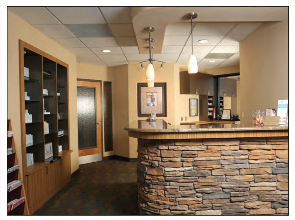
Updated reception area

Everything prior to driving the first nail is part of a feasibility study, and this is necessary in order to define your goals,