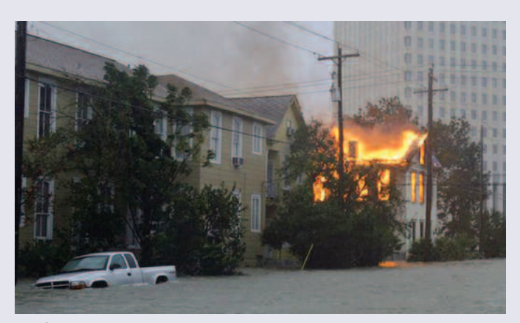
Gulf residents continue to clean up after Hurricane Ike

Research projects should be EVIDENCE BASED MEDICINE OUTCOME STUDIES specific to women's issues, including but